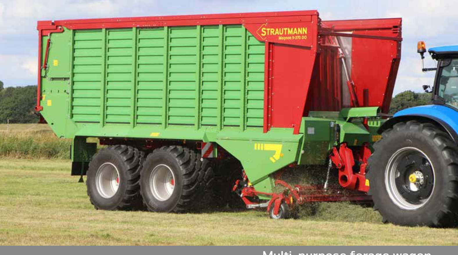
Multi-purpose forage wagon