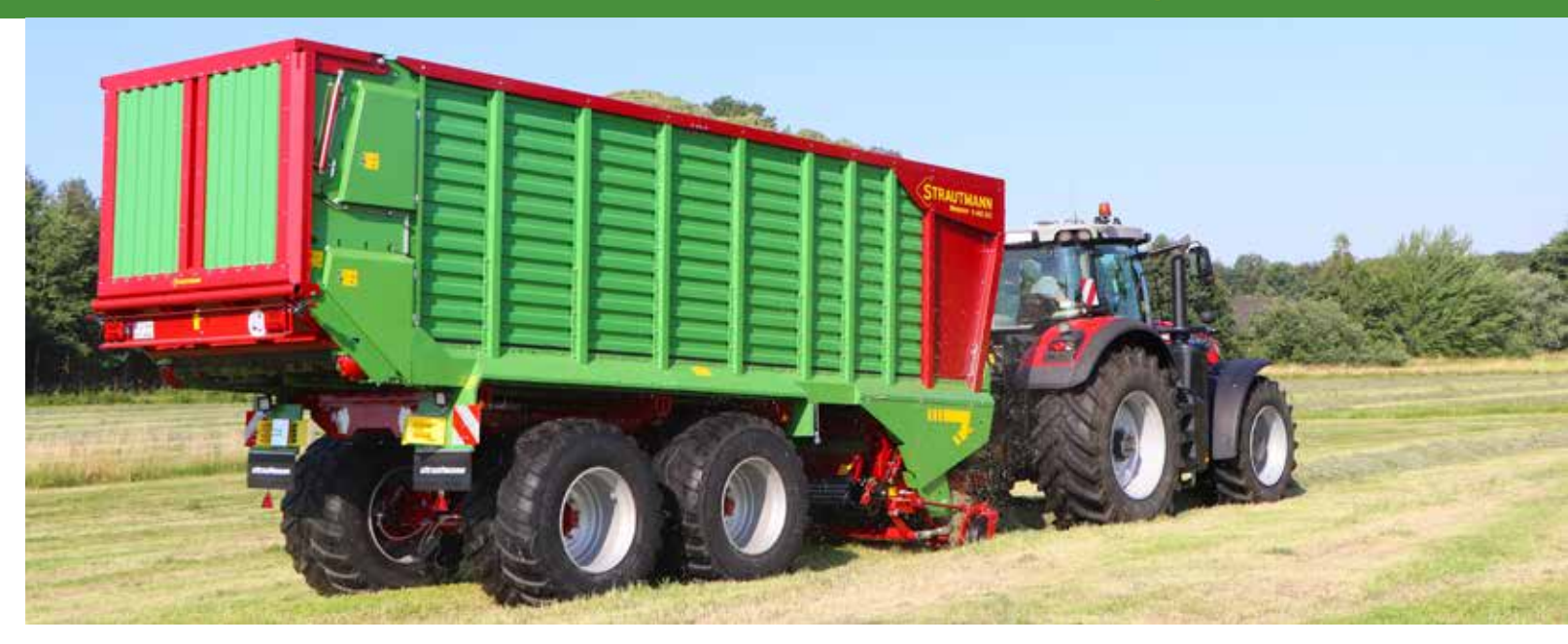
Magnon 9: The best for you and your animals!

Low-wear, 8 mm wide scrapers made of Hardox ensure the largest possible scraper surface and reliably prevent the crop from becoming mashed. The special contour of the scrapers ensures a scraper angle of over 90 degrees, making it easy to detach any crop from the conveying tine.