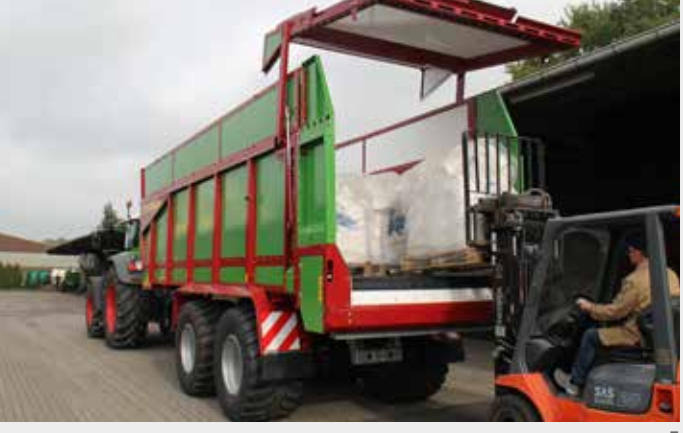
Technical modifications reserved Technical modifications reserved