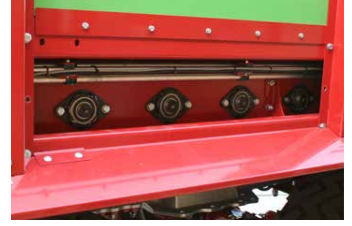
Technical modifications reserved