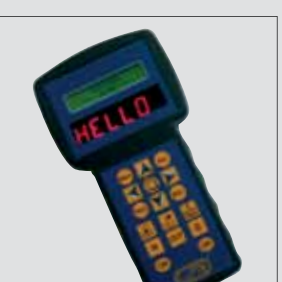
Radio remote control PTM AV 50